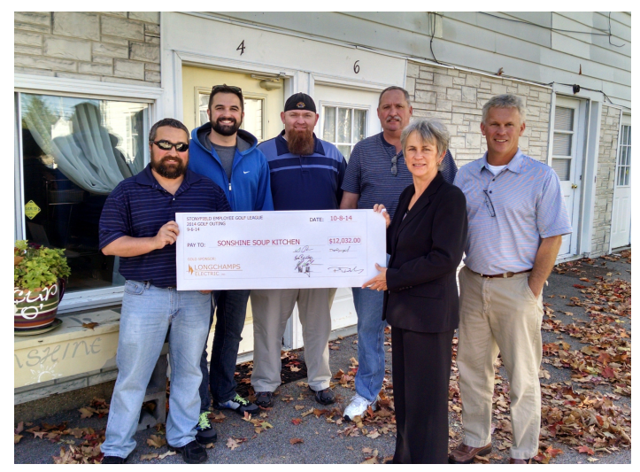
Fourth year running, the Stonyfield Employees' Golf League designated the tournament proceeds and food drive to the Sonshine Soup Kitchen. This year netted $12,032. How can so much fun pay off so handsomely?

The community is very generous in its support of our mission at the Sonshine Soup Kitchen, with too many donors to list, and we are grateful to each and every one. But we must mention a few extraordinary businesses and clubs whose generosity merits mentioning. These include: